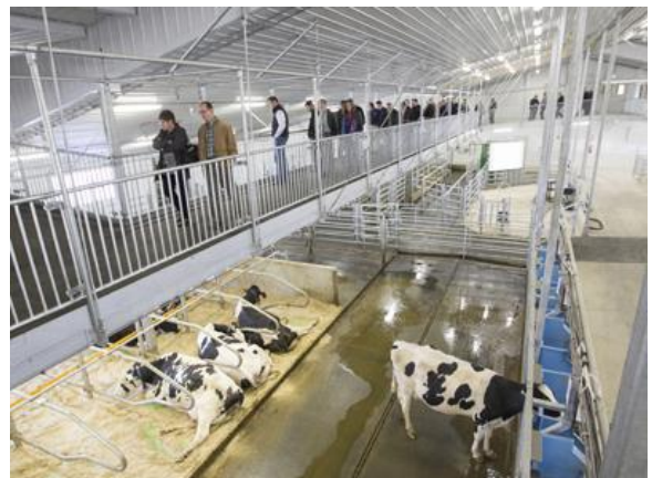
Rayner Dairy Research and Teaching Facility

We'll take you on a 1 hour tour of the Canadian Light Source (synchrotron) at the University of Saskatchewan, then bus you to the Rayner Dairy Research and Teaching Facility on campus where the Poultry Extension department will guide you through the dairy and briefly present current poultry research.